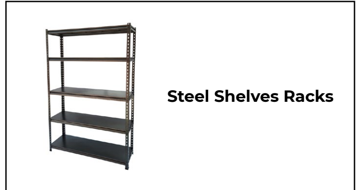
Steel Shelves Racks

Dimension : L1200 x D400mm Thickness : Beam : 0.4mm Surface treatment : Powder coating